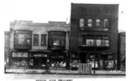
Buildings removed on North Broadway.

Where the Terminal Tower now stands was once a collection of old buildings "covered with rust, soot and advertising, which bore witness to Cleveland's first mercantile age" (<u>http://www.csuohio.edu/CUT/</u><u>gamut1.htm</u>). You would have seen the Old Stone Church (1855) and the Society of Savings Bank (1889). You would also have seen the construction of the new Federal Building (1893) and the Williamson Building (1900). (These buildings were both demolished in 1982 to make way for the Sohio (currently called BP America) headquarters. You might also have seen the Soldiers' and Sailors' Monument.