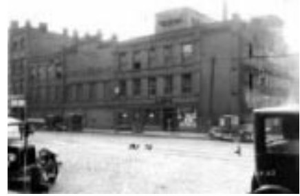
Buildings removed from West Ontario

To see more of these scenes, go to http://www.csuohio.edu/CUT/gamutill.htm and view some of the photos.